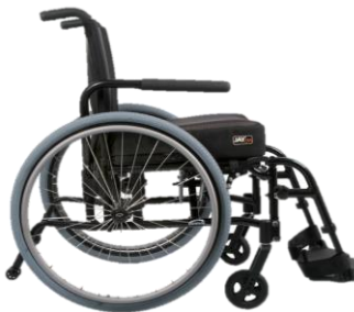
Quickie QXi, Ultra Lightweight Adjustable Folding Wheelchair