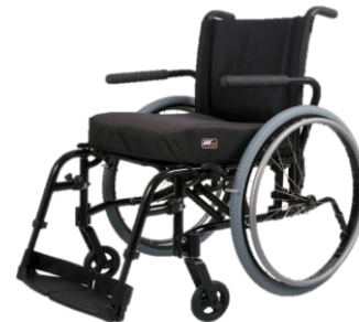
Quickie QXi featuring the Jay ION™ cushion