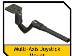
Multi-Axis Joystick Mount