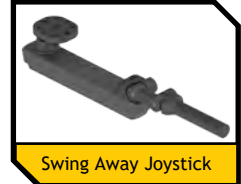
Swing Away Joystick

As pictured to the right "Swing Away Joystick Offset Mount (Right)"