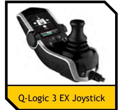
Q-Logic 3 EX Joystick