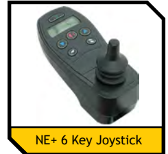
NE+ 6 Key Joystick