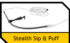
Stealth Sip & Puff

Part: ST-SP625-U-Q. AADL CODE W100 Includes straw and mounting hardware. Use with Stealth i-Drive Head Arrays.