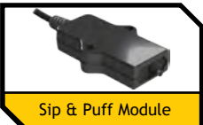
Sip & Puff Module

Part: CTL168056 ADP: WEX5 AADL CODE W100 Includes module and mounting hardware.