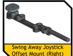
Swing Away Joystick Offset Mount (Right)